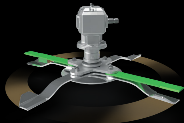
X-CUT 6 BLADE CONFIGURATION The ultimate in high-performance mulching.

The X-CUT 6 blade configuration provides additional mulching capability by including four regular cutting blades (shown in grey) supplemented by two extra mulching blades (shown in green) set at a higher cutting plane, which further reduces vegetation to an even finer mulch.